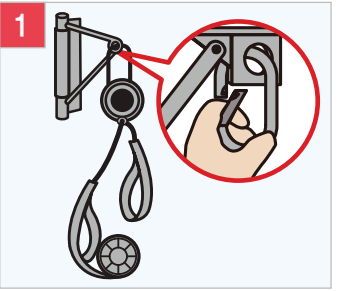
Fasten support loop and descending device loop.