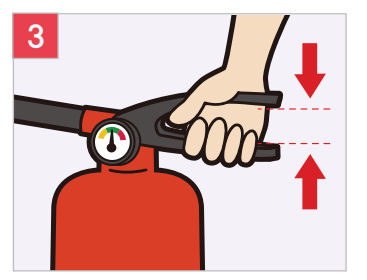
Squeeze the handle.