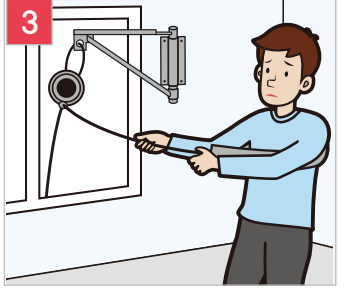
Tighten the descending device belt to the breast.