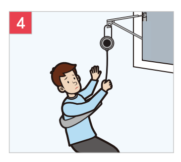
Descend safely with a tap on the wall.

Fire suppression How to use the fire extinguisher